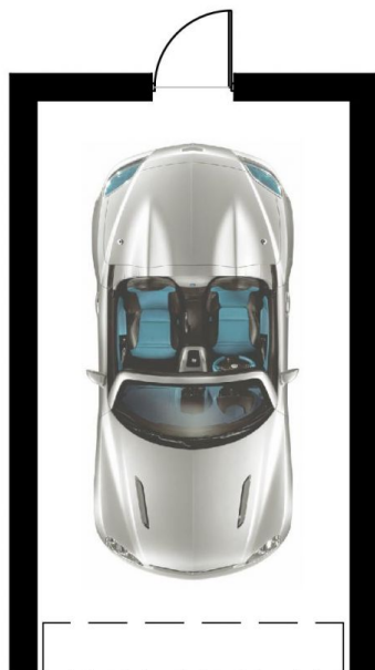
Garage 3.0 x 5.5m