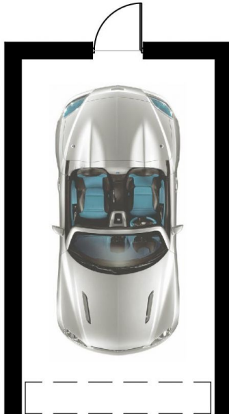
Garage 3.0 x 5.5m