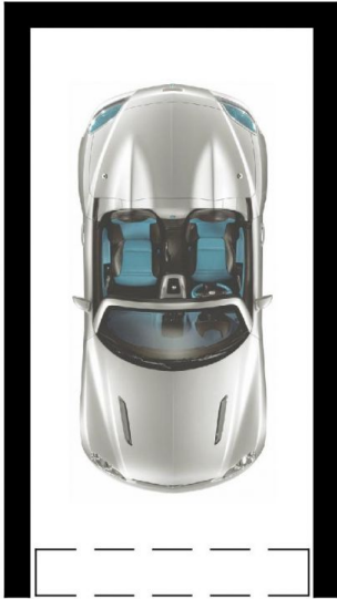
Garage 3.0 x 6.1m