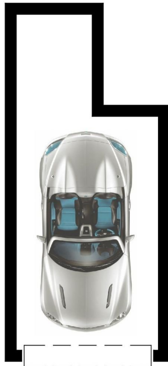
Garage 21m 2