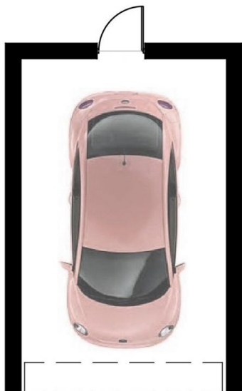
Garage 3.4 x 5.5m