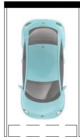
Garage 3.0 x 5.5m