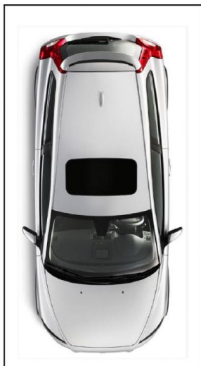
Car Space (Secure) 2.5 x 5.5m