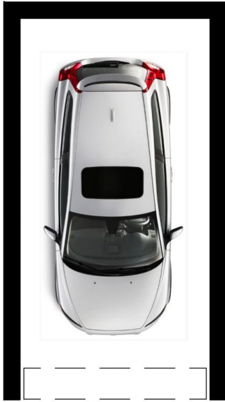
Garage 2.7 x 5.6m