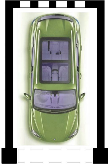
Garage 3.0 x 5.5m