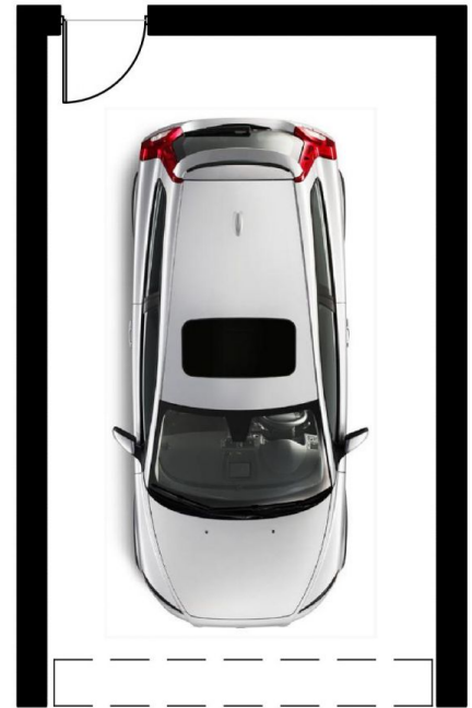
Garage 3.5 x 6.0m