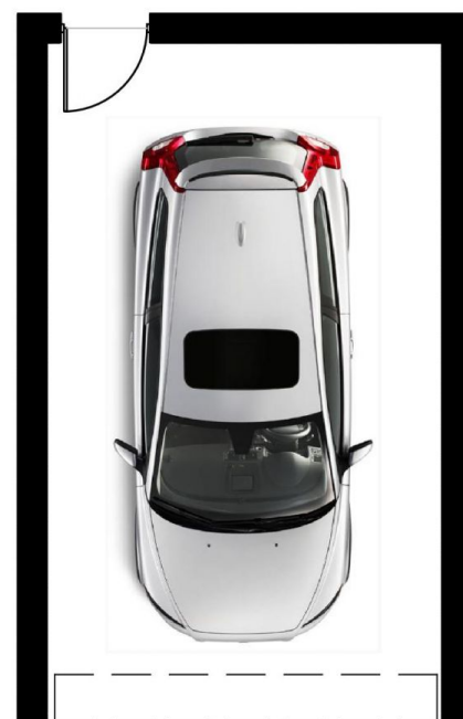
Garage 3.5 x 6.0m