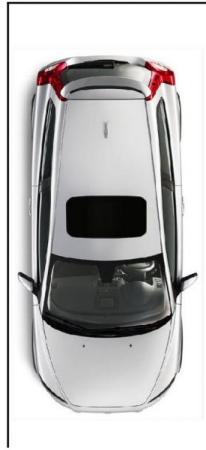
Secure Car Space