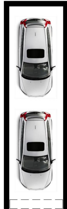
Garage 3.0 x 11.0m