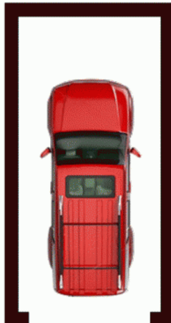
Garage 2.8 x 5.8 m