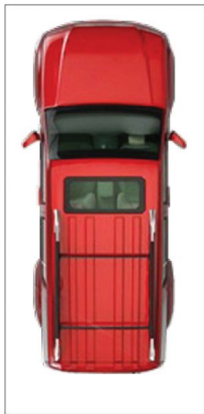
Security Car Space