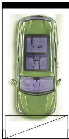
Garage 5.6 x 3.0m